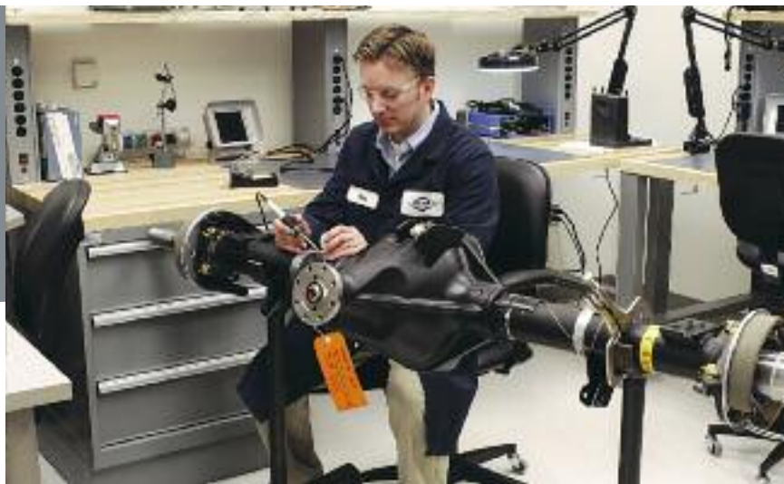
Dana's Taipei, Taiwan, facility supplies axles and propshafts in the Asia-Pacific region.