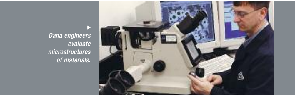
Dana engineers evaluate microstructures of materials.